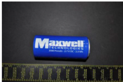
Test Article(s) A001