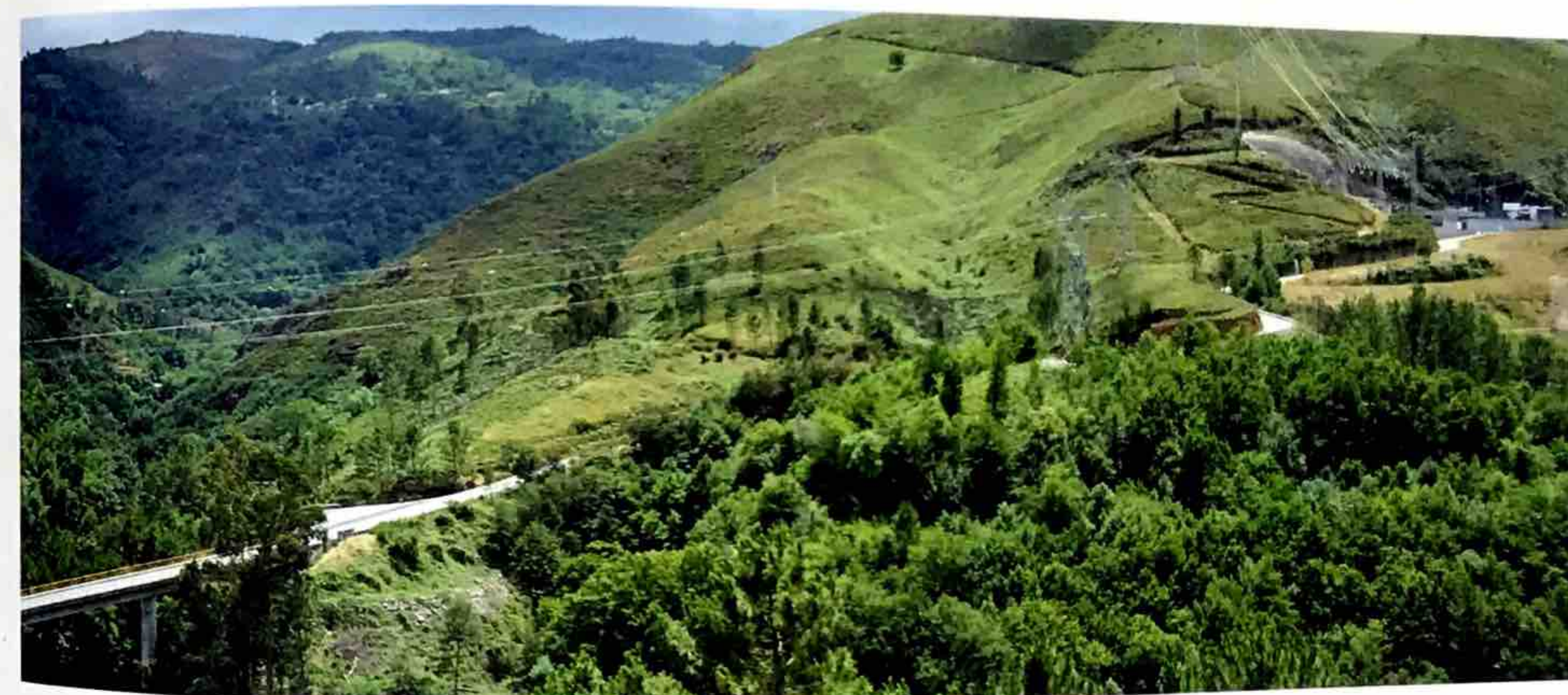
(Left) Saft Li-ion energy storage enables SEV to optimize wind power for the Faroe Islands at Husahagi. (Middle) Maxwell ultracapacitors with cell management and monitoring. (Right) Pumped storage power plant Frades II, north-west of Portugal.

motor-generator that offers three advantages: 1) it can respond faster and more flexibly to the active and reactive demand from the power grid; 2) it provides additional stability in the event of a drop-in voltage; and 3) it enables a fast restart if a power outage occurs. Following the successful start-up, the biggest variable speed pumped storage plant in Europe is considered the flagship project for further plants worldwide.