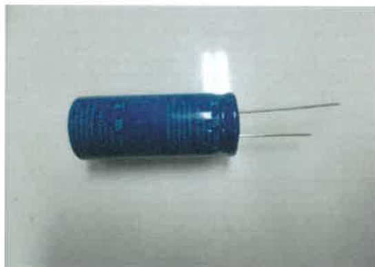
Picture of Sample as Received

This document is issued by the Company subject to its General Conditions of Service printed overleaf, available on request or accessible at http://www.sgs.com/en/Terms-and-Conditions.aspx and, for electronic format documents, subject to Terms and Conditions for Electronic Documents at www.sgs.com/terms_e-document.htm . Attention is drawn to the limitation of liability, indemnification and jurisdiction issues defined therein. Any holder of this document is advised that information contained herein reflects the Company's findings at the time of its intervention only and within the limits of Client's instructions, if any. The Company's sole responsibility is to its Client and this document does not exonerate parties to a transaction from exercising all their rights and obligations under the transaction documents. This document cannot be reproduced except in full, without prior written approval of the Company. Any unauthorized alteration, forgery or falsification of the content or appearance of this document is unlawful and offenders may be prosecuted to the fullest extent of the law. Unless otherwise stated the results shown in this test report refer only to the sample(s).