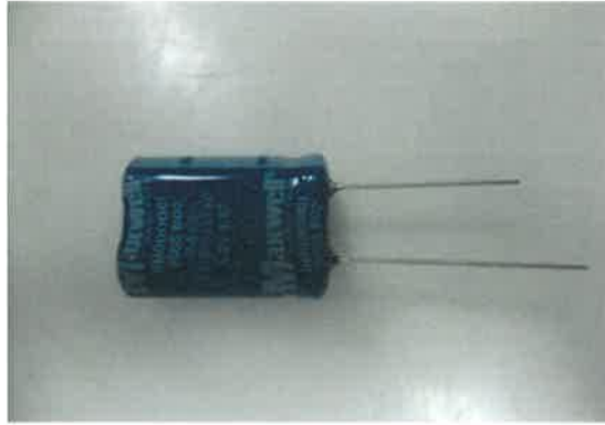
Picture of Sample as Received

This document is issued by the Company subject to its General Conditions of Service printed overleaf, available on request or accessible at http://www.sgs.com/sgs/terms-and-conditions.html , and, for electronic format documents, subject to Terms and Conditions for Electronic Documents at www.sgs.com/terms_e-document.html . Attention is drawn to the limitation of liability, indemnification and jurisdiction issues defined therein. Any holder of this document is advised that information contained hereon reflects the Company's findings at the time of its intervention only and within the limits of Client's instructions, if any. The Company's sole responsibility is to its Client and this document does not exonerate parties to a transaction from exercising all their rights and obligations under the transaction documents. This document cannot be reproduced except in full, without prior written approval of the Company. Any unauthorized alteration, forgery or falsification of the content or appearance of this document is unlawful and offenders may be prosecuted to the fullest extent of the law. Unless otherwise stated the results shown in this test report refer only to the sample(s).