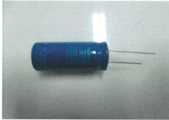
Picture of Sample as Received

This document is issued by the Company subject to its General Conditions of Service printed overleaf, available on request or accessible at http://www.sgs.com/en/terms-and-conditions and, for electronic format documents, subject to Terms and Conditions for Electronic Documents at www.sgs.com/terms_e-documents.htm . Attention is drawn to the limitation of liability, indemnification and jurisdiction issues defined therein. Any holder of this document is advised that information contained hereon reflects the Company's findings at the time of its intervention only and within the limits of Client's instructions, if any. The Company's sole responsibility is to its Client and this document does not exonerate parties to a transaction from exercising all their rights and obligations under the transaction documents. This document cannot be reproduced except in full, without prior written approval of the Company. Any unauthorized alteration, forgery or falsification of the content or appearance of this document is unlawful and offenders may be prosecuted to the fullest extent of the law. Unless otherwise stated the results shown in this test report refer only to the sample(s).